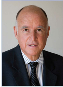
EDMUND G. BROWN JR. Governor