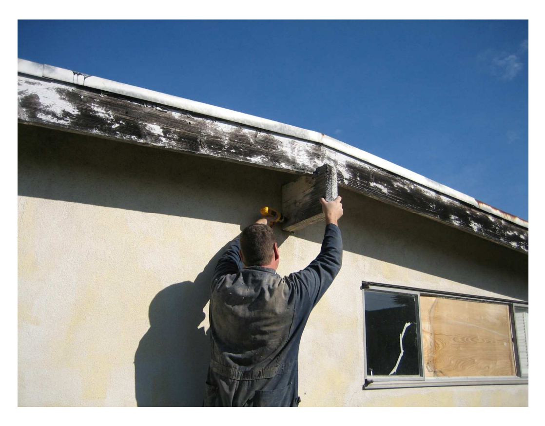
Figure 3. Example of drilling a board infested with drywood termites before Treatment; location Torrance, CA. Included in image is M. Red, Clark Pest Control.