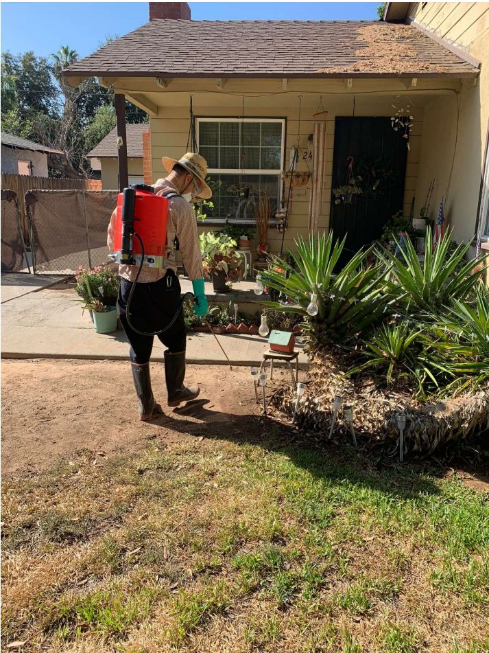
Fig. 2. Treatment of a house with a spot treatment (bifenthrin or botanical spray).