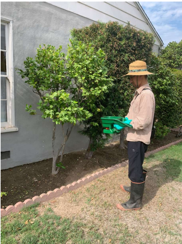
Fig. 6. Treatment of a house with biodegradable hydrogel beads containing 25% sucrose and 1% boric acid.