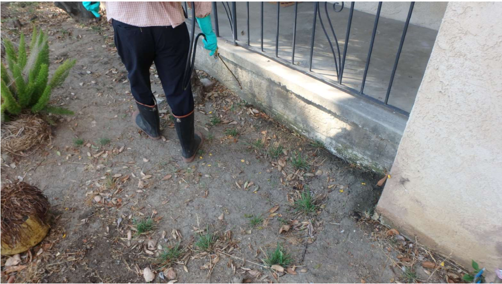
Fig. 1. Treatment of a house with a perimeter spray (fipronil spray).