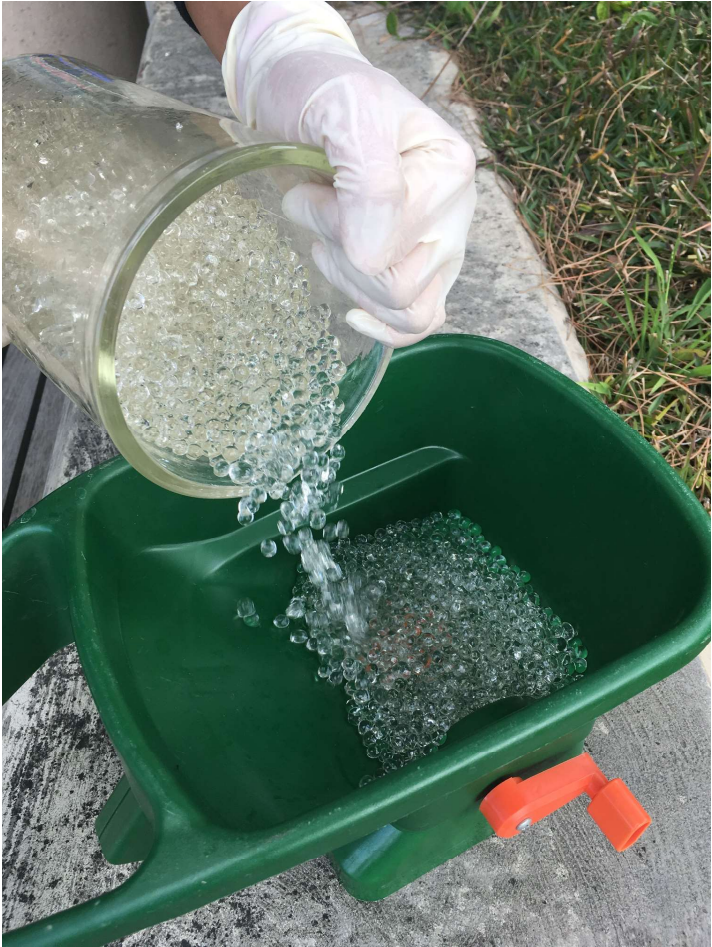
Fig. 4. Testing with the hand-held sprayer.