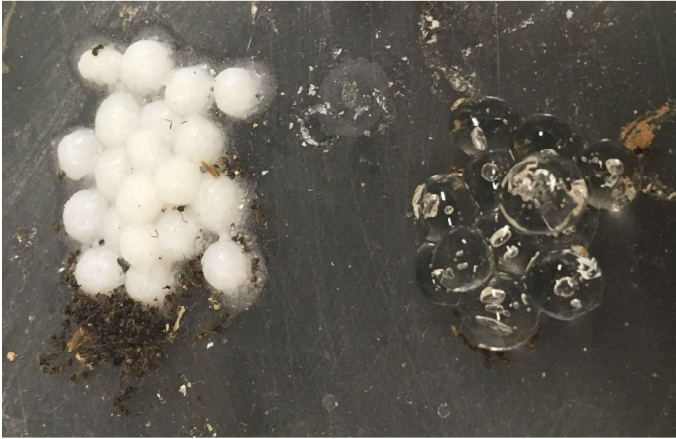
Fig. 5. Rehydration test with the final hydrogel bait. The hydrogel bait beads on the left are completely dried. When enough amount of water is provided, these dry hydrogel beads can be rehydrated (right), becoming palatable to foraging ants once again.